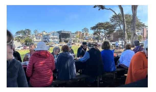
Chorale Members at Shamel Park

In December, the Chorale will present its Holiday Concert Event, "It's the Holiday Season," at the Cambria Community Presbyterian Church. Concert Dates are December 10<sup>th</sup> and December 17<sup>th</sup> at 2:00 p.m. Tickets are $20.00 for adults. Students with a valid ID are free. Ticket sales begin on Tuesday, October 24<sup>th</sup>, and will be available at the Cambria Chamber of Commerce, from a chorale member, or online at <a href="https://my805tix.com/">https://my805tix.com/</a> or through our website at <a href="https://cambriachorale.org/">https://cambriachorale.org/</a>